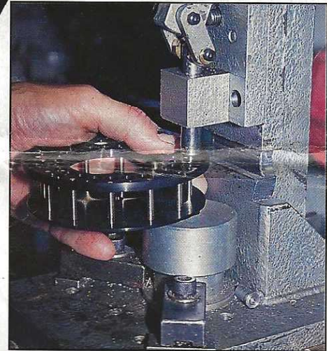
9. When the black anodised plates return to the workshop, the assembly of the centrepin begins with the riveting of the front and back spool plates with nickel silver rivets on a hand press.