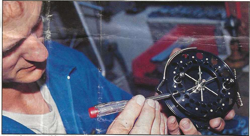
11. When assembly is complete the centrepin is precision balanced to perfection then polished ready for delivery.